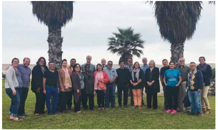
SU Latin America Community Group 2016