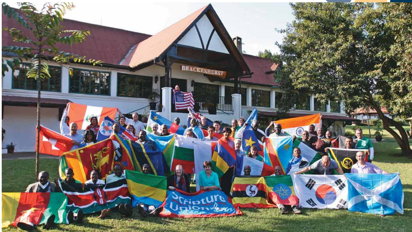
SU Leading Staff Development Course (LSDC) 2015