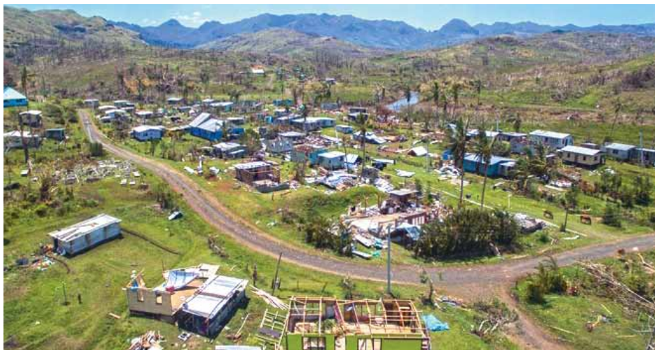
Fiji after Cyclone Winston