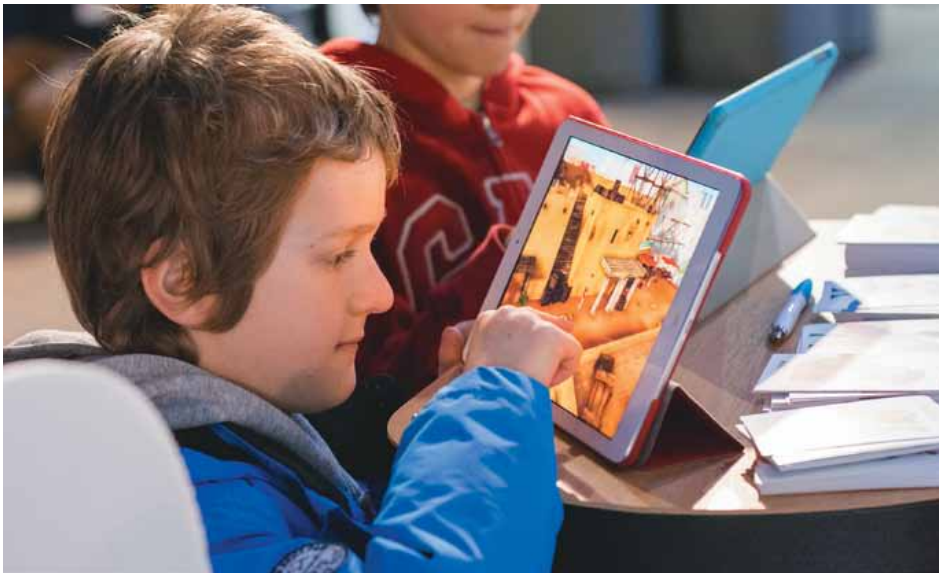
Guardians of Ancora