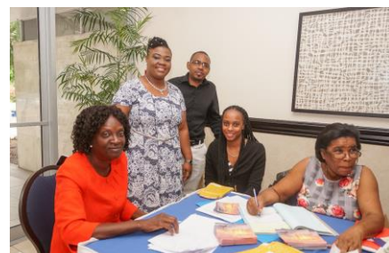
Meet and Greet