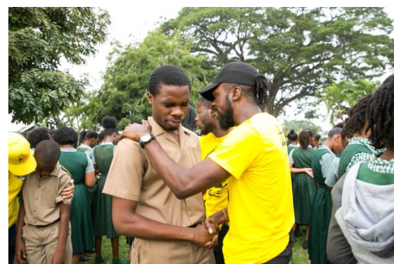
Volunteer counselling student