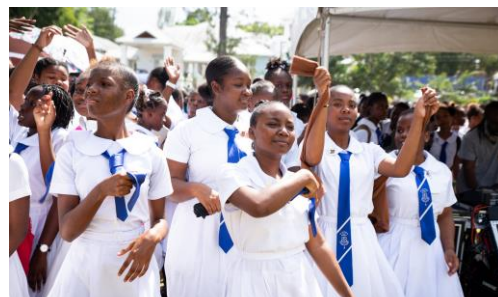
Students in worship

“What we wanted to do was to go back into the schools and instil the same values we learnt when we were growing up. We wanted to meet the students where they are, using music, dance and drama to highlight positive solutions to the challenges they face. This has allowed us to connect with the students tremendously,” stated Sinclair.