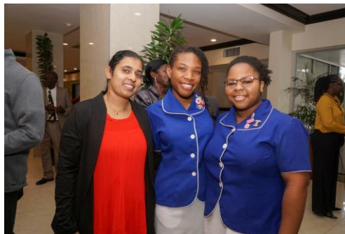
Students and Teacher from Immaculate Conception High School