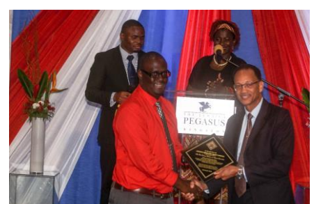
Presentation of plaque to Jamaica Broilers Group Ltd.