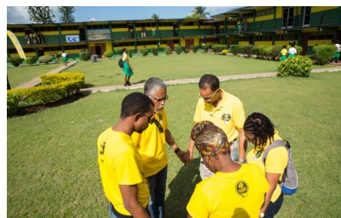
Jamaica House of Prayer