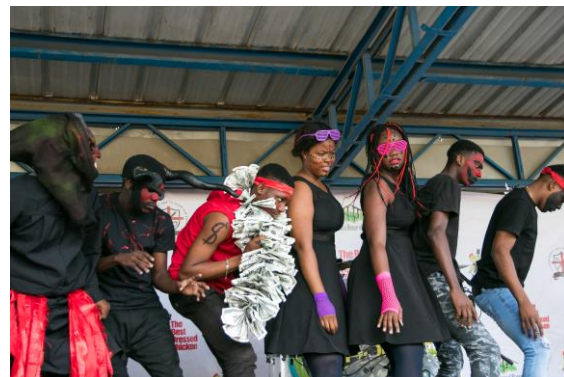
Drama by Youth Reaching Youth