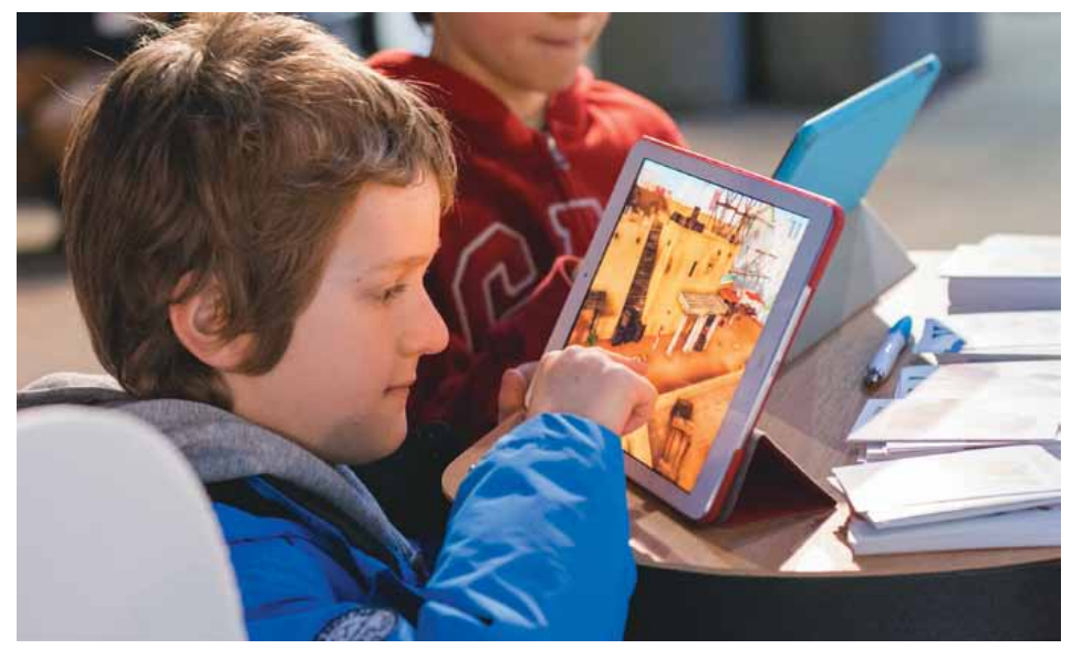
Guardians of Ancora