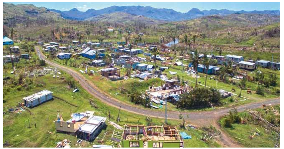
Fiji after Cyclone Winston