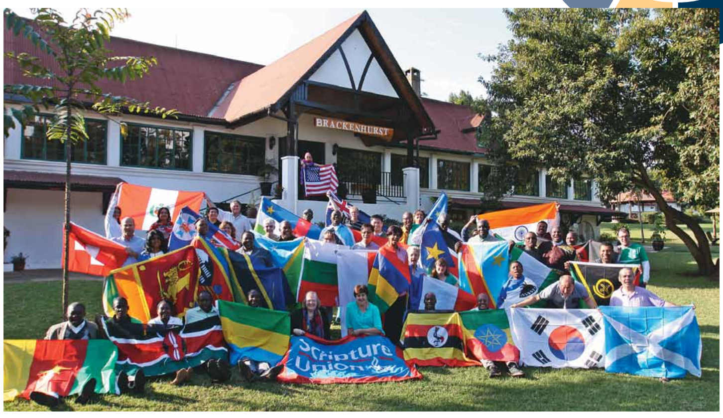
SU Leading Staff Development Course (LSDC) 2015