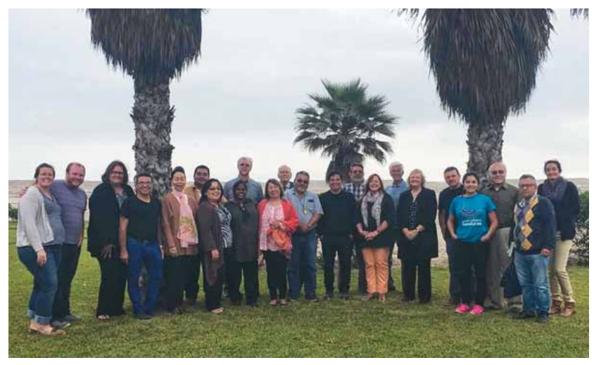
SU Latin America Community Group 2016

A copy of the Aims, Belief, and Working Principles is available on www.scriptureunion.global